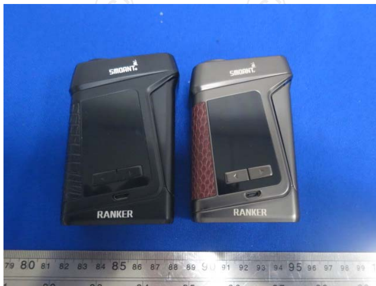
Smoant Ranker TC 218